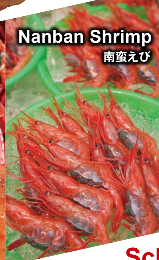
Nanban Shrimp 南蛮えび