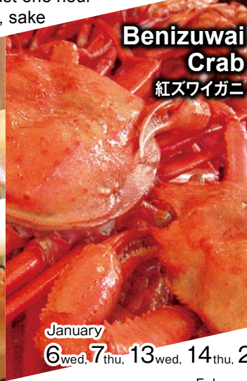
Benizuwai Crab 紅ズワイガニ