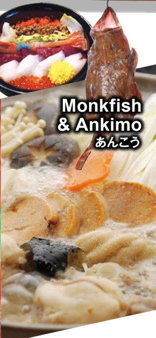
Monkfish & Anko あんこう