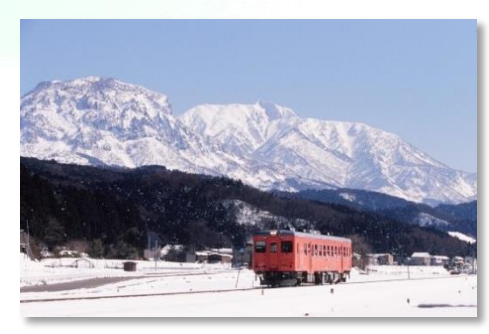
Oito Line passing through the beautiful Himekawa Gorge